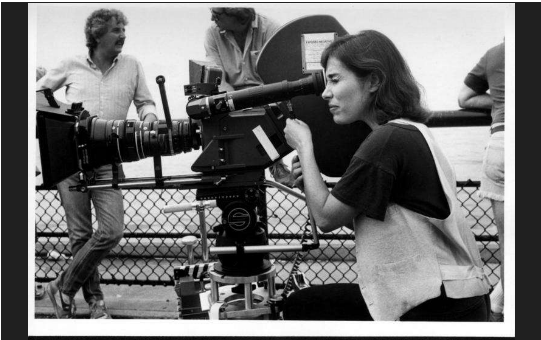
Mystic Film Festival's 2021 Lifetime Achievement Award Winner Susan Seidelman in 1985 directing her romantic comedy "Desperately Seeking Susan."